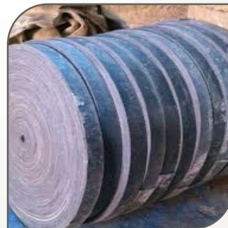
Balata Packing as per BS 351