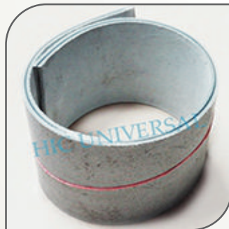
Leather Nylon per ISO 554